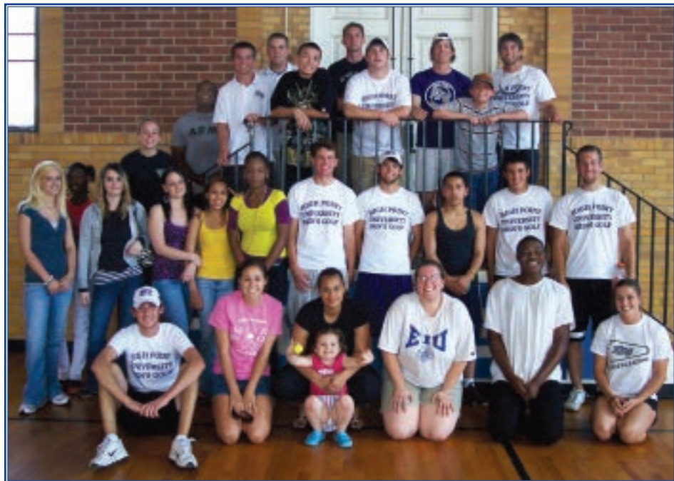
High Point University Athletes at American Children's Home

The High Point Community Foundation's staff has had the pleasure of working with many of these