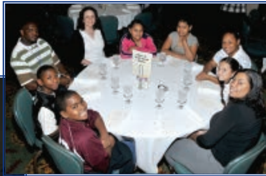
Boys & Girls Club of GHP

underdog. His greatest legacy will no doubt be the many young people he encouraged and underwrote to attend college."