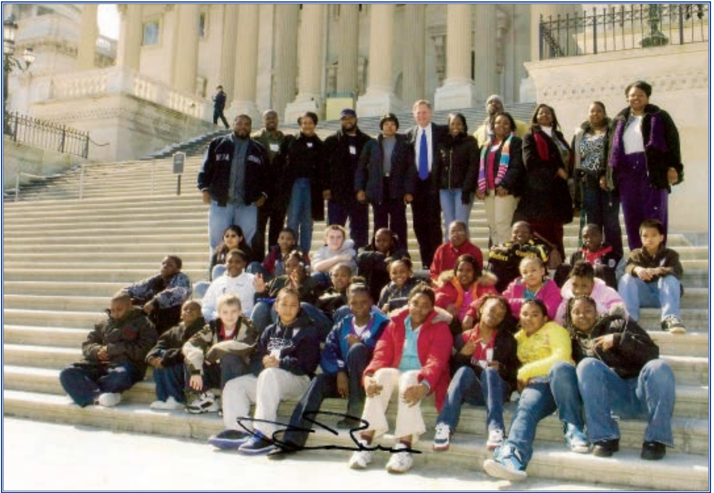
Kirkman Park 5th graders & Senator Richard Burr