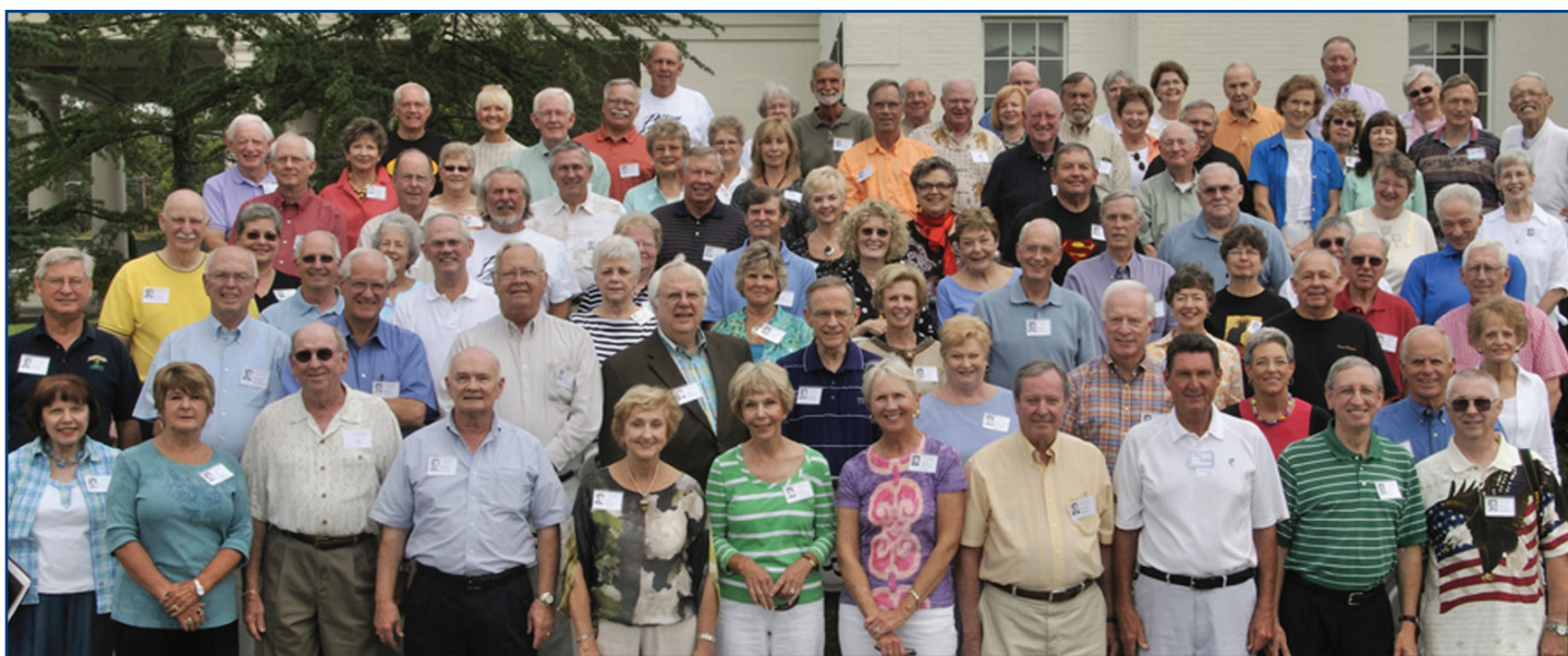
High Point High School Class of 1960

High Point Central High School has traditionally played a key role in the academic, social and emotional growth of generations of students and how fitting that the future of the school and indeed the High Point Community, will be shaped by the product of this great institution. 🏆