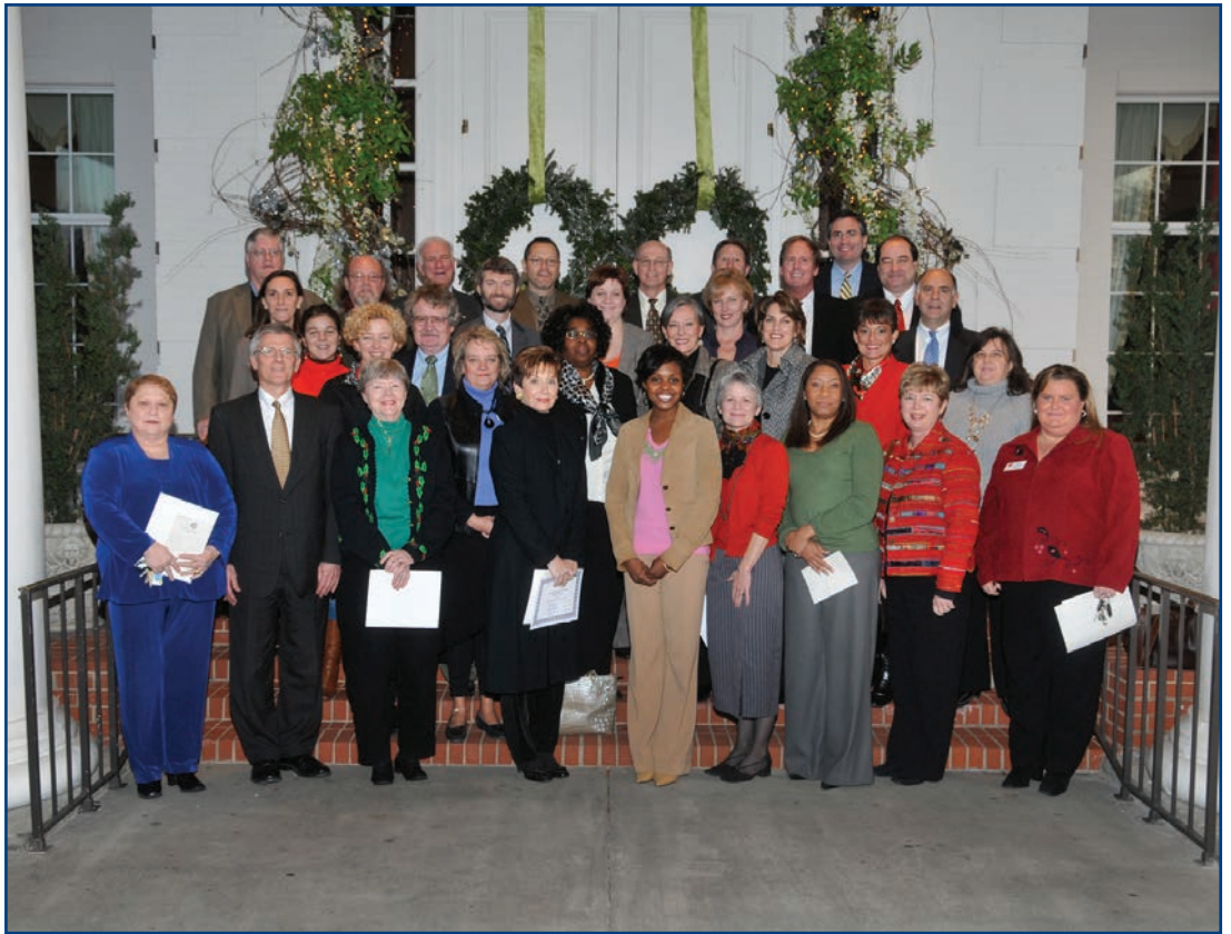
2009 grant recipients